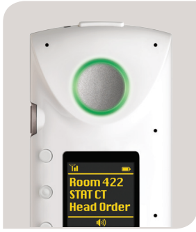
B3000n Badge uses an illuminated Halo to provide visual indication of call status.