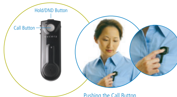
Pushing the Call Button

The Hold/DND button is also a "no" button. When you have an incoming call, you can press the Hold/DND button once to send the call to voicemail. This is the same as saying, "no" when the Genie asks, "can you take a call from..."